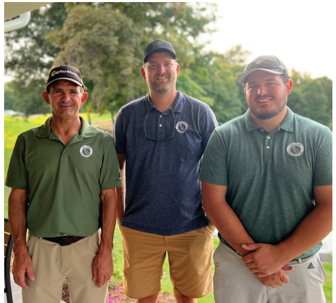
Graber Post Building third place team