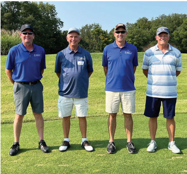
Daviess-Martin County REMC team

This year, Daviess-Martin County REMC had five key accounts teams — one Daviess-Martin County REMC team, two Graber Post Buildings teams, one Riverview Farms team and one Grain Processing Corporation team. A Graber Post team even finished third!